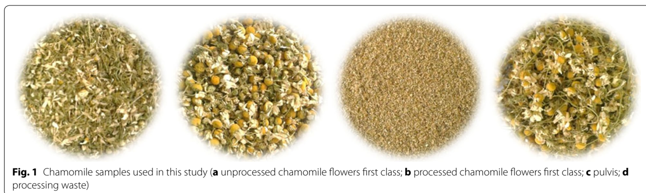
Fig. 1 Chamomile samples used in this study (a unprocessed chamomile flowers first class; b processed chamomile flowers first class; c pulvis; d processing waste)

Processed chamomile flowers first class (Fig. 1b) are obtained after cutting the stems from picked chamomile flowers. High capacity sieve separates flower heads from